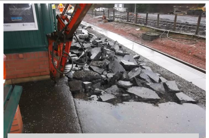
Breaking out Existing Surfacing